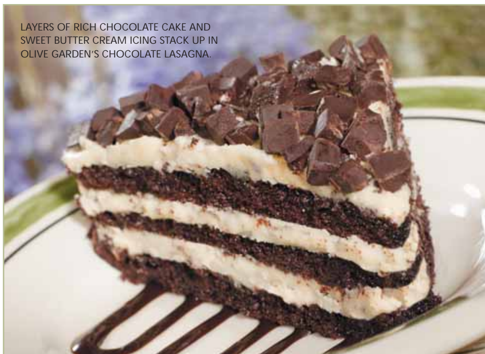
LAYERS OF RICH CHOCOLATE CAKE AND SWEET BUTTER CREAM ICING STACK UP IN OLIVE GARDEN'S CHOCOLATE LASAGNA.